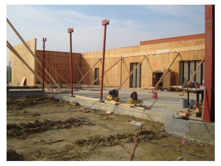
1. Library modernization in progress on 2/2/10.

Status: JRH Construction continues to work on the following activities: The rough carpentry for the new library area is ongoing. MEP rough-in is in progress as the framing continues.