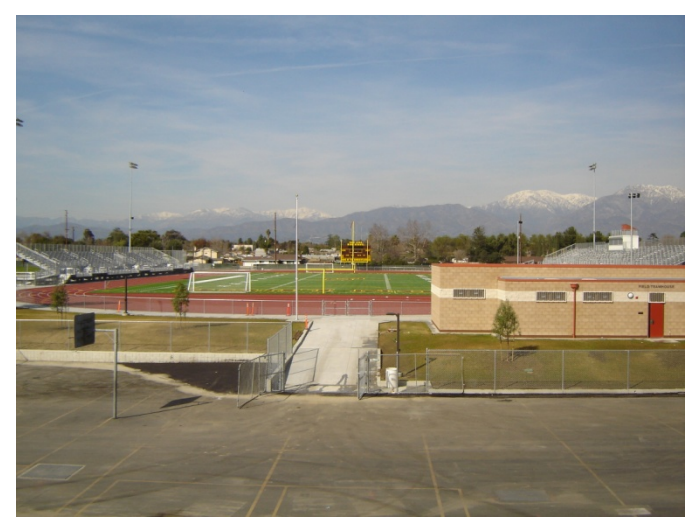
3. Site overview- work in progress.