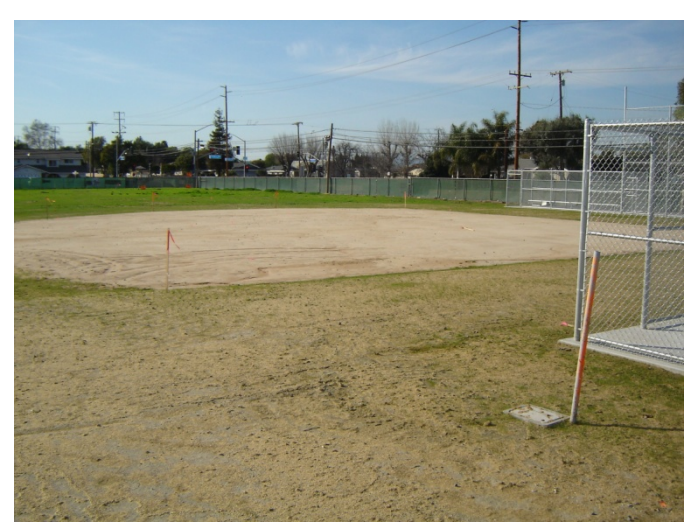
4. Hydroseed at softball field.