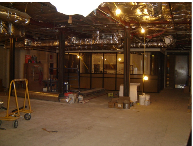
4. Existing building library expansion .