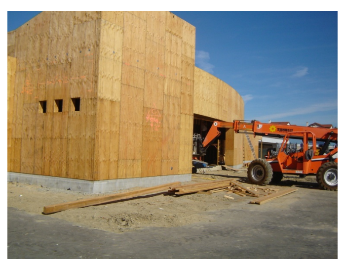
2. Ready for exterior finishes.