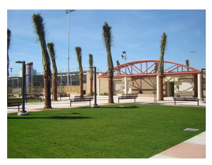
1. Front entrance.

Status: Construction is complete and we are in the closeout process. The punchlist is nearly complete with just a few items outstanding. The closeout documents are nearly complete per BDI and will be submitted for review by March 19<sup>th</sup>.