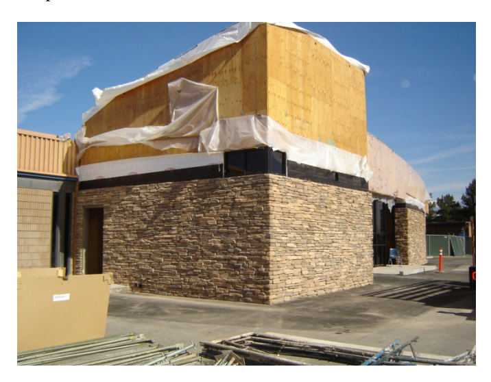
1. South side of building expansion.

Status : JRH Construction has continued to work on the following activities: The stacked stone veneer has been installed. The Tyvek wrap and lath for the plaster has now begun. The sheet metal paneling is ready for installation. Interior MEP rough-in is complete.