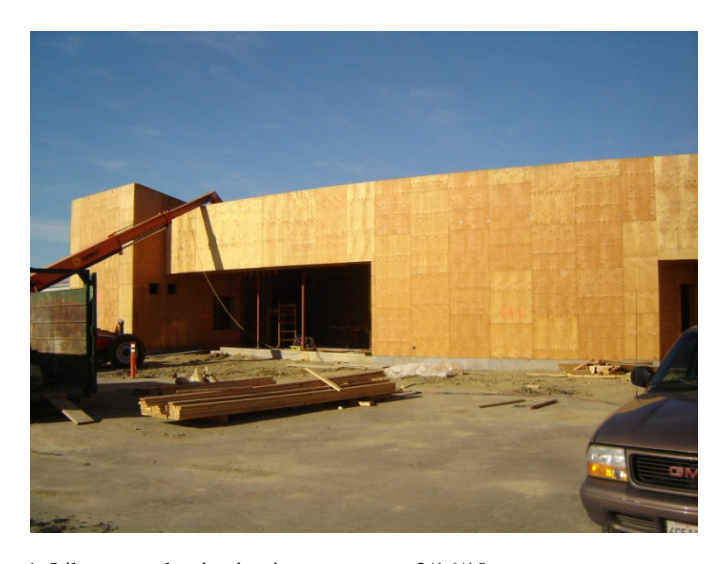
1. Library modernization in progress on 3/16/10.

Status : JRH Construction continues to work on the following activities: The rough carpentry for the new library area is complete. Interior MEP rough-in work is ongoing. The roofing is ongoing. The asphalt around the building is ready to be patched. Once the asphalt is patched, the exterior finishes will begin.