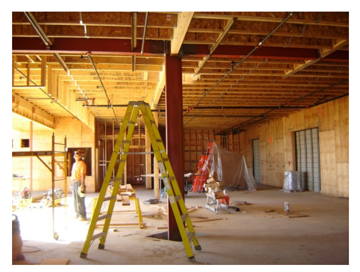
3. Expansion interior in progress.