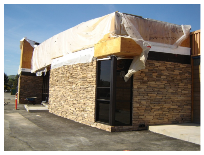
2. North side of building expansion.