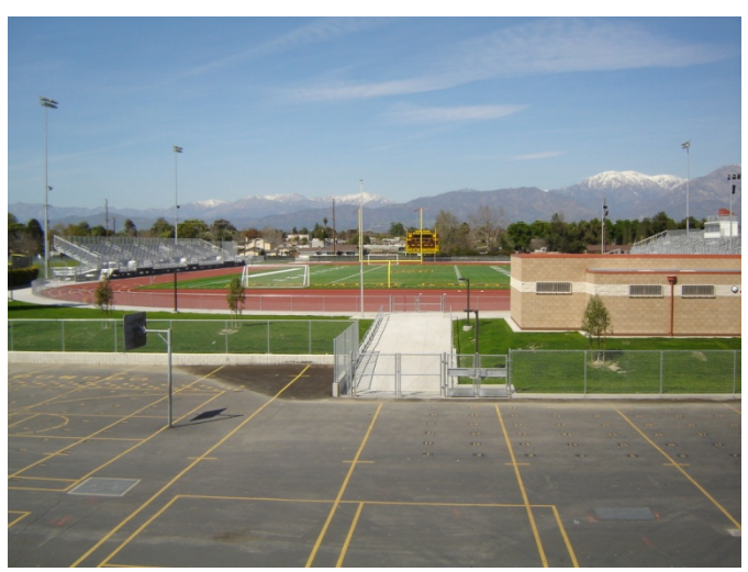
3. Site overview- work complete.