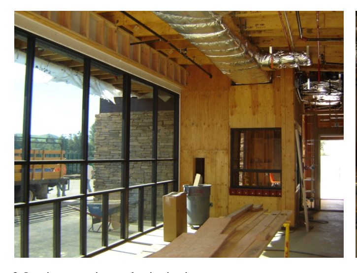
3. Interior expansion modernization in progress.