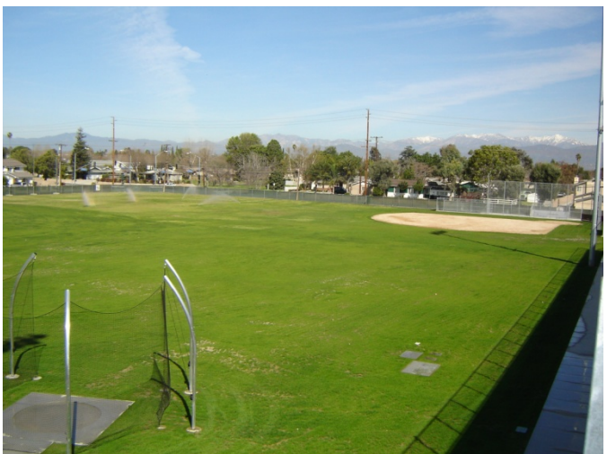
4. Softball fields.