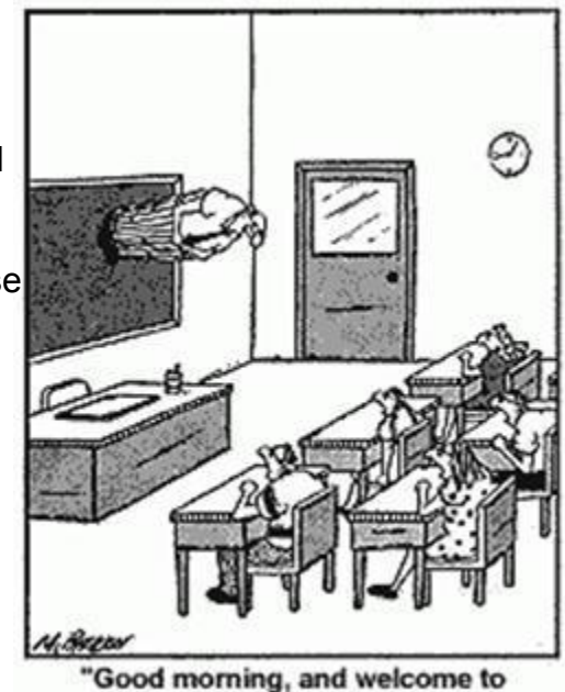
The Wonders of Physics."

Pen #2 Pencil Paper Graph Paper 3 Ring Binder or Folder (for Discovery Labs) Calculator (Scientific) Highlighter Chromebook