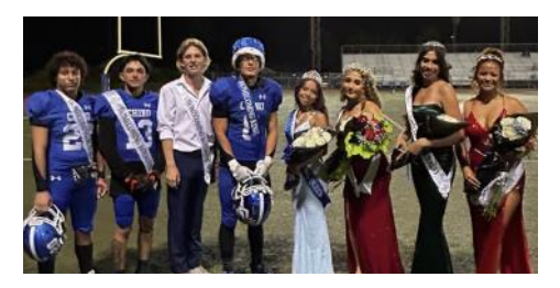
2023 Senior Homecoming Court at Homecoming Game.

The cheerleaders brought in junior cheerleaders. The junior