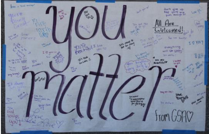
Suicide Awareness Poster from Suicide Prevention Event.

nal warning signs include making suicidal threats, self-harm, expression in art or writing, uncontrolled anger, substance abuse, withdrawal from friends, family, and society, being reck-