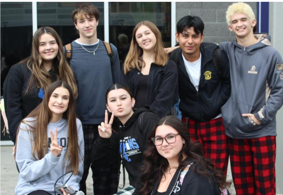
Group of Chino High students together at lunch enjoying the lunchtime game on Wednesdays pajama spirit day.

During this week, ASB hosted games during lunch for anyone willing to participate, dressed in the spirit day's theme. These activities lead up to the rally that's at the end of the week.