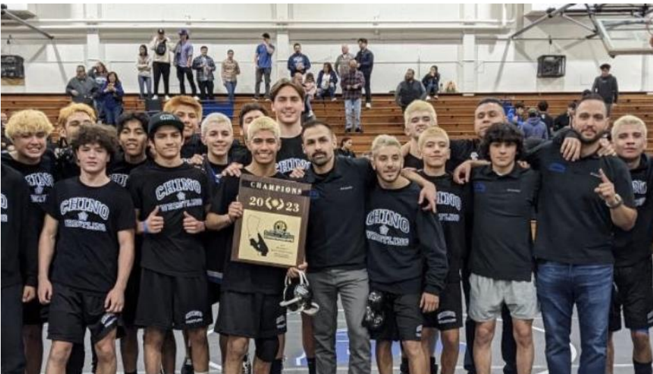
Chino Highs varsity wrestling team winning the schools very first wrestling CIF championship while displaying their bleach blonde hair.

These trends have been seeing increases with sports such as American football, soccer, and wrestling growing rapidly in recent history. With the increase in youth/high school athletes, some players start to want to individualize through hairstyle.