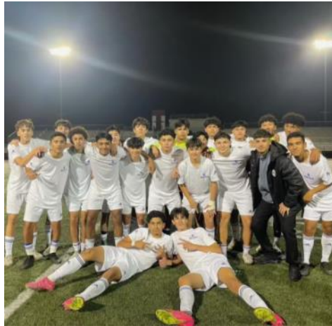
Boys Soccer team taking group picture celebrating win over opponent.

After asking him about his team's future, he said "I feel like we are going to make the CIF playoffs this year because we have been on a roll. I am