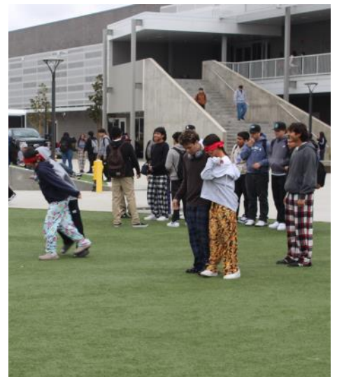
Students playing lunchtime games to celebrate the spirit week.

1/25 Thursday: Disney Duos. Dress as your favorite Disney Duo with a partner. This day allowed CHS students to use their creativity with their