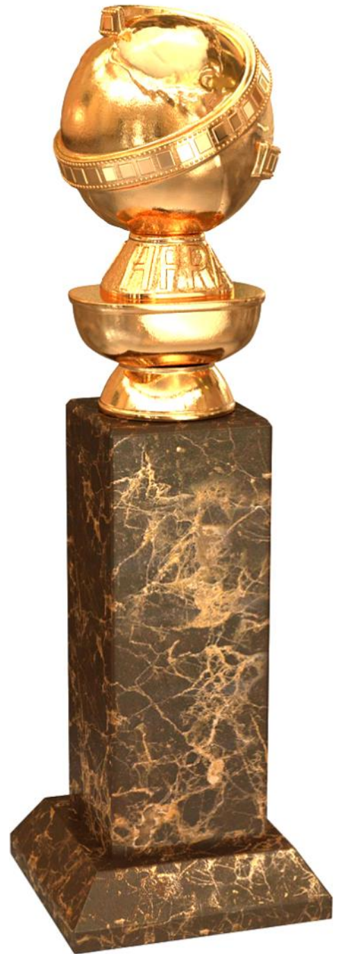
The Prestigious Golden Globe Award

Other films included in this year's golden globes include; "Barbie", "The Holdovers", "Poor Things", and "The Boy and the Heron."