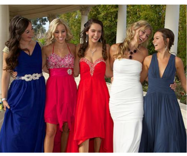
lar style de-emphasizing the stock photos.

sic prom dress for girls would be a fitted bodice pieced with a full skirt of tulle, organza, taffeta, and satin. Ruffles also were very bountiful. Men had the similar standard of tuxedos and suits. Colored suits were popular as well, differing in shades or red or blue. Yet, throughout most of the years, black was always the most popular of suits for men.