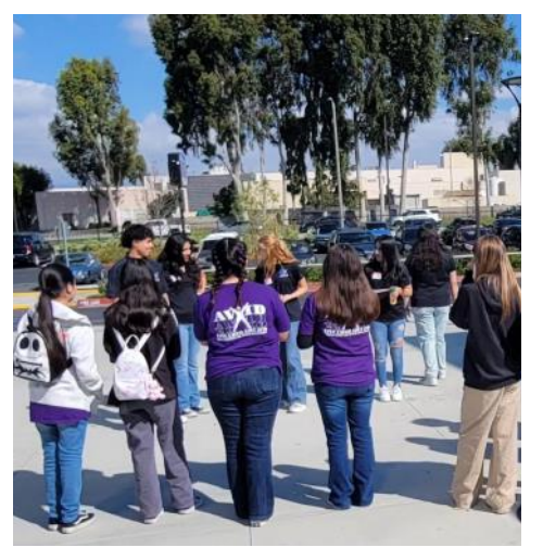
Woodcrest AVID students arriving at Chino and being sorted into groups ready to start their tour