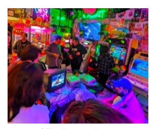
Inside of The Ratnest Record store and Arcade

His inspiration for creating the shop was a previously shut