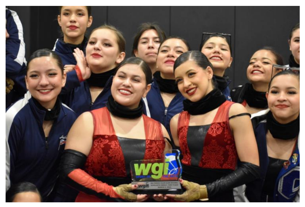
Chino World Guard celebrates their first-place award after a great performance in Phoenix.

As the team made it to Phoenix, they all had just enough time to practice at a nearby high school that was willing to spare their gym just for them to practice in. Although everyone was tired from the ride alone, they all still had just enough energy to put efforts into their practice that night before going to the hotel. When everyone made it to