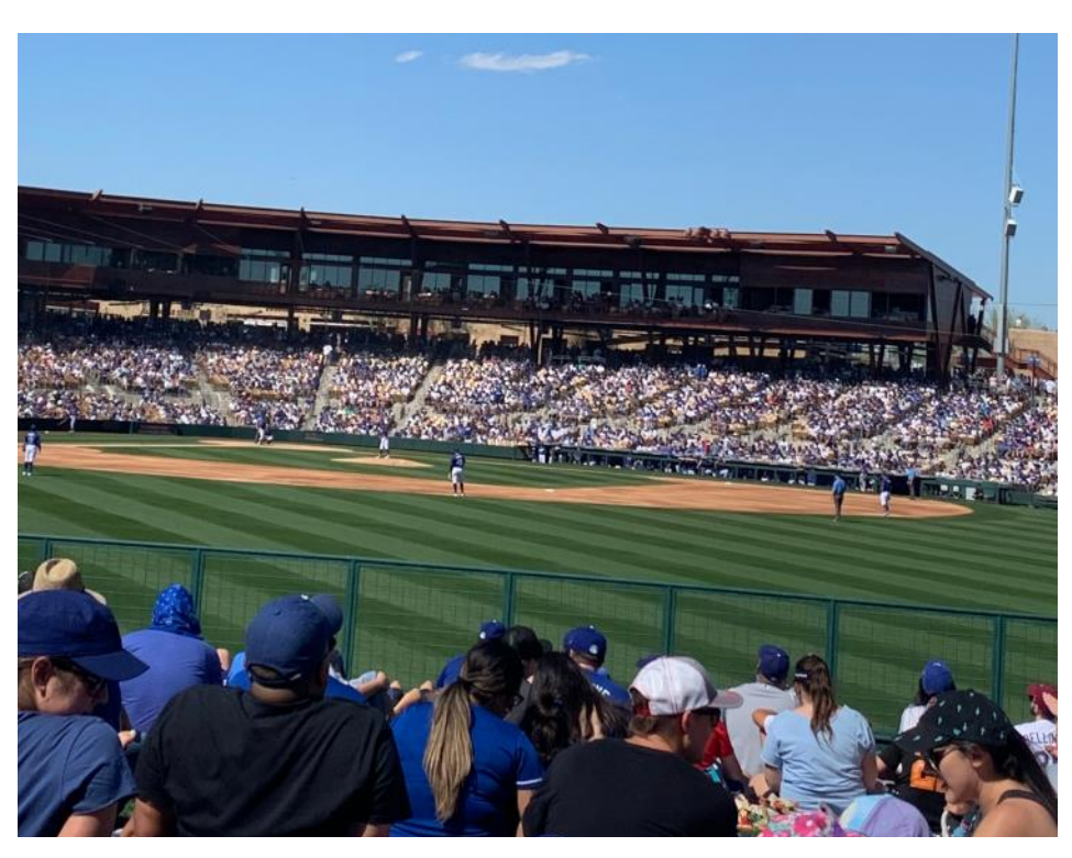
Dodgers VS White Sox at Dodger Stadium for their Spring training Game. Dodgers won this game with a final score of 9-6. In their next face off the Dodgers pulled off a double digit win ending 12-9 against the White Sox.

Spring training is ending as the first game of the regular season starts March 26th, 2024, where the Dodgers and Padres face off in Seoul, South Korea. The Dodgers ended their spring training with a record of 13-5.