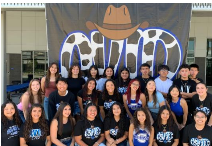
The Senior AVID Class of 2024 Together