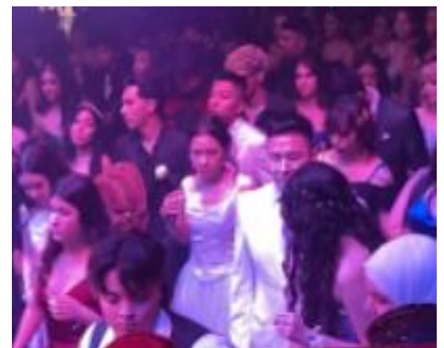
Chino High students on the dance floor at prom.

The theme was chosen by ASB, the tickets went on sale on March 6 th price was $110 and with the ASB card it was $100. For students to go to prom they had to sign a dance contract and have their ID cards to enter.