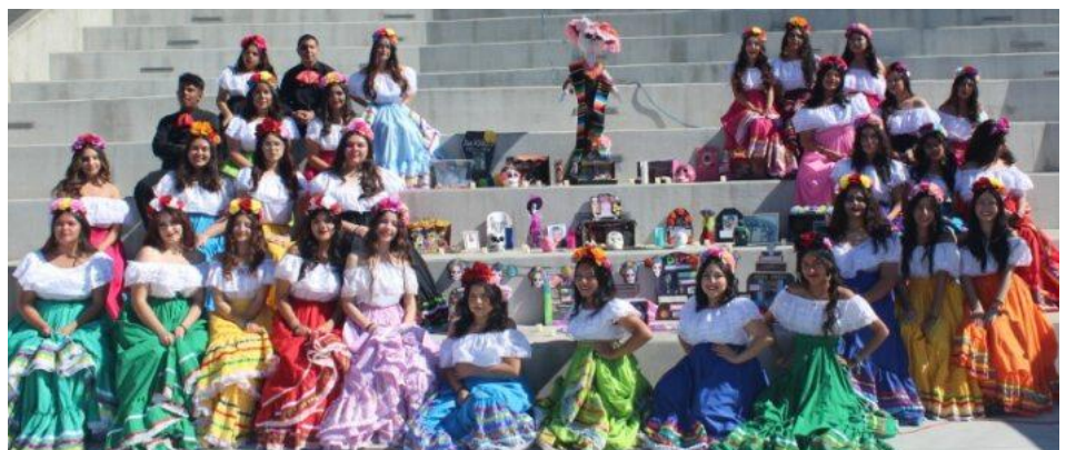
The 2024 Chino High School Folklorico Dance team together for a picture.