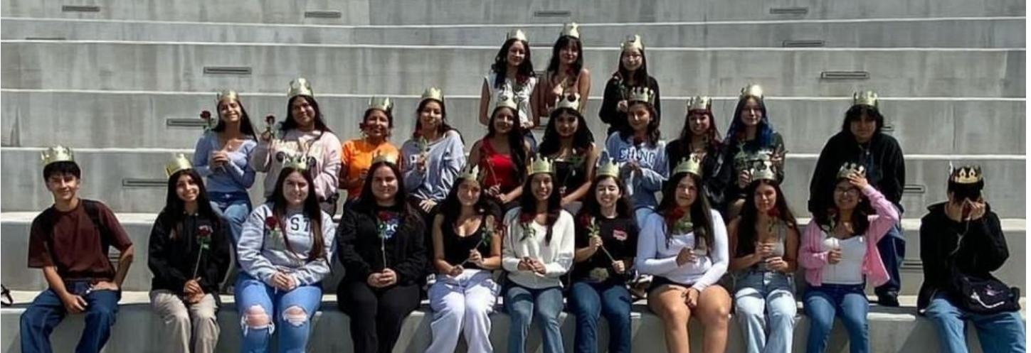
Chino High Folklorico team welcomes new members to be apart of the club for the 2024-2025 school year!

In September, the Folklorico Club held tryouts after school and during lunch. Although the club welcomes all cultures and ethnicity's, the club is a way for student of Mexican decent to express and learn about the cultural dance known as folklorico.