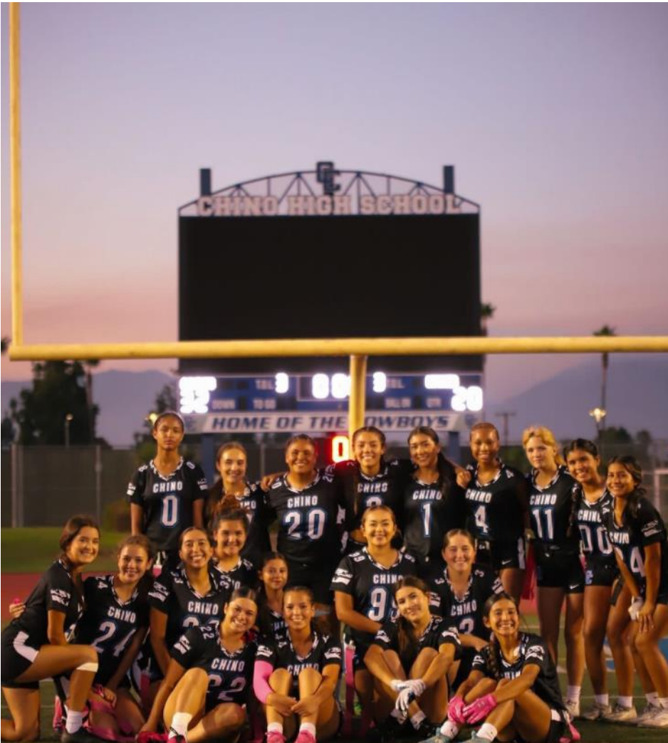
Varsity Flag Football team after their home game win against Chino Hills with a score 32-20.