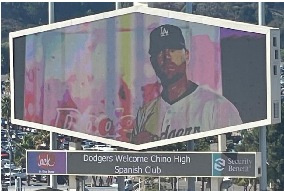
The Dodger team welcoming the Chino High Spanish Club students during the game on the billboard.