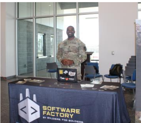
Army recruiter ready to share information about his position in the army.