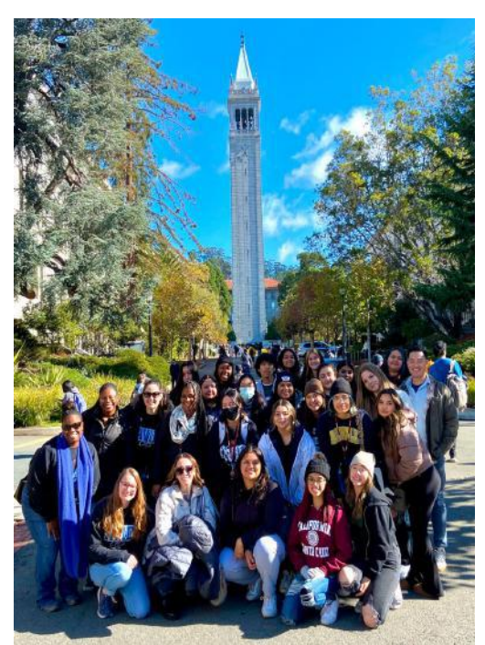
Avid students and Chino High staff posing in front of the famous Sather Tower at UC Berkley.

They returned home on November 9, at around 9pm. In total, these Avid students were able to tour six different Universities located in California.